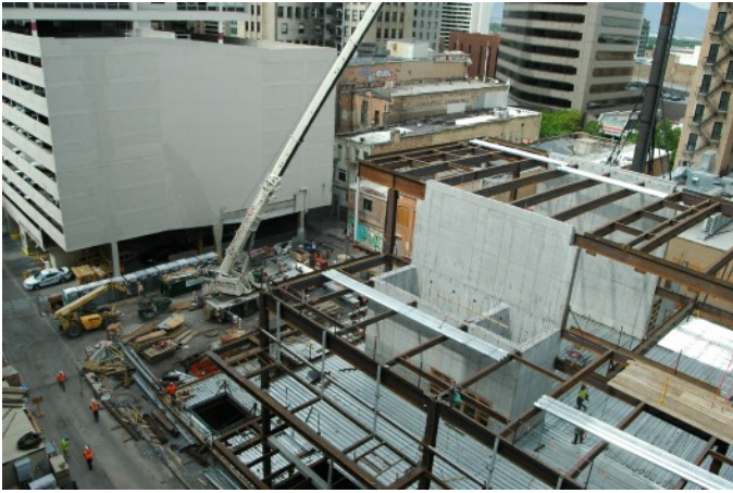
Walker Center garage, facing west