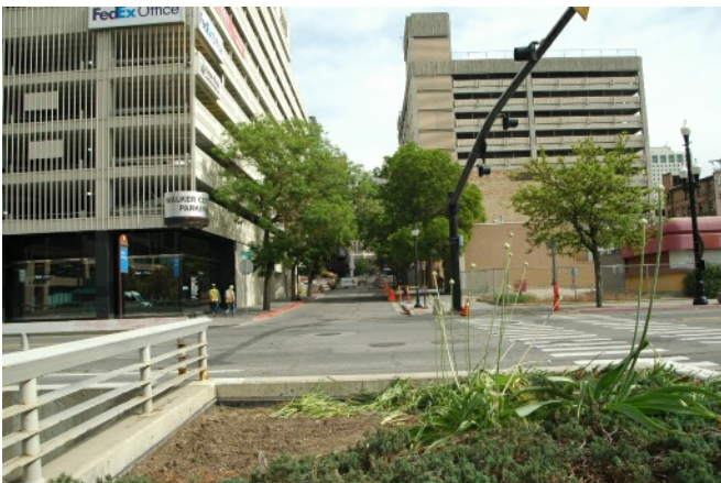
Facing north from Gallivan Plaza