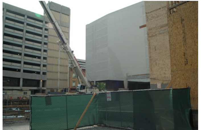
Walker Street garage from mid block, facing south