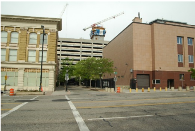
Orpheum Avenue from State Street, facing west