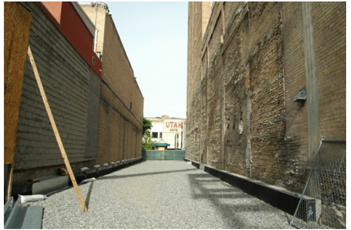
From plaza, facing west