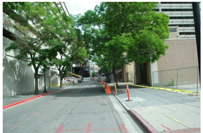
Facing north from corner of 200 South Regent