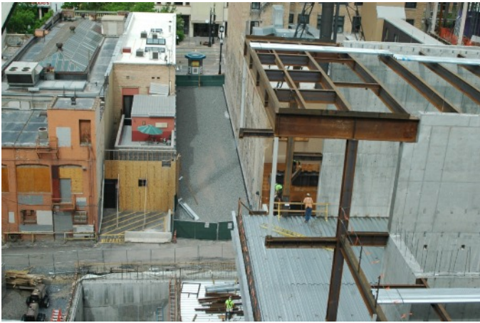
Overhead from Regent Street Garage, facing west