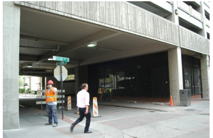
Orpheum Avenue from Regent, facing east