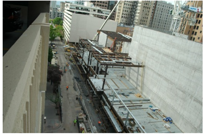
Facing south toward Gallivan Plaza