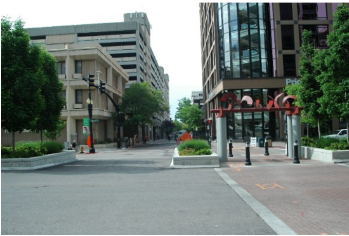
From City Creek Center, facing south