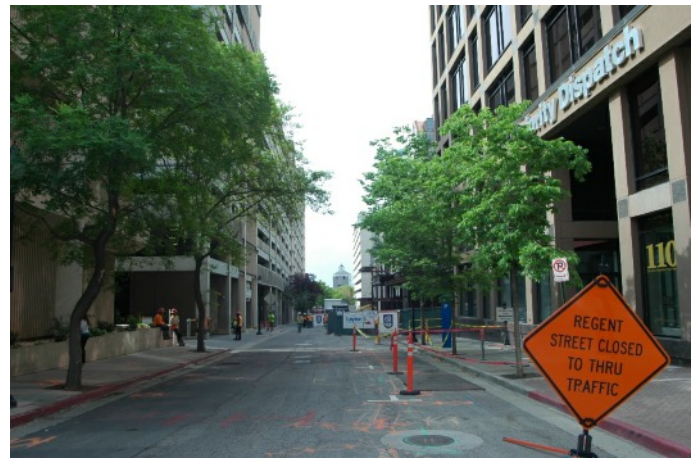
From 100 South Regent, facing south