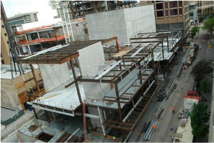
Facing north toward City Creek Center