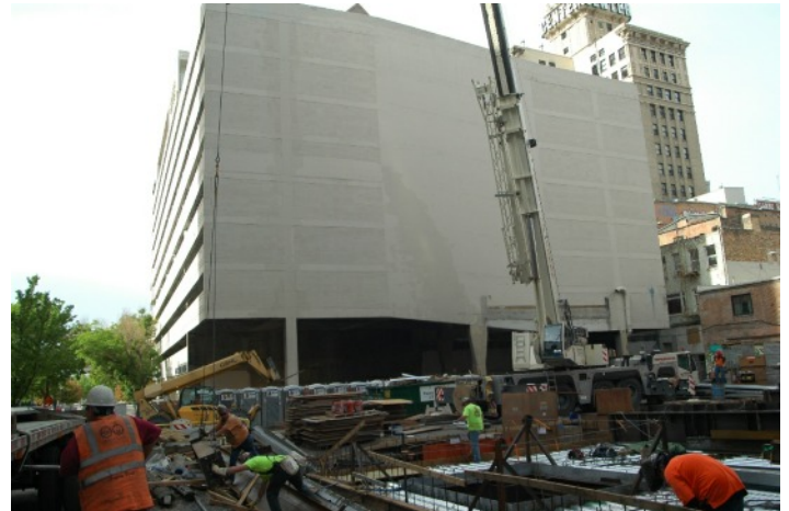
Walker Center garage, facing south