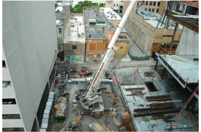
Facing west over plaza